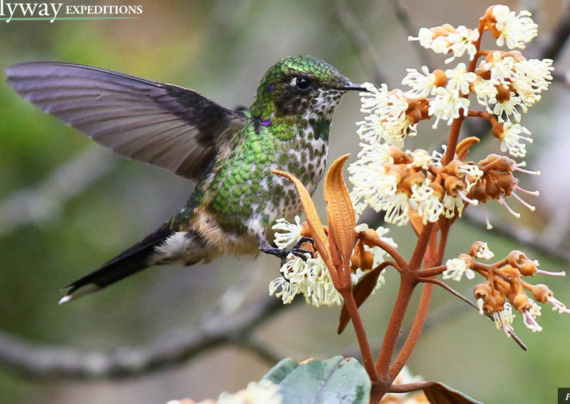
Purple-backed Thornbill