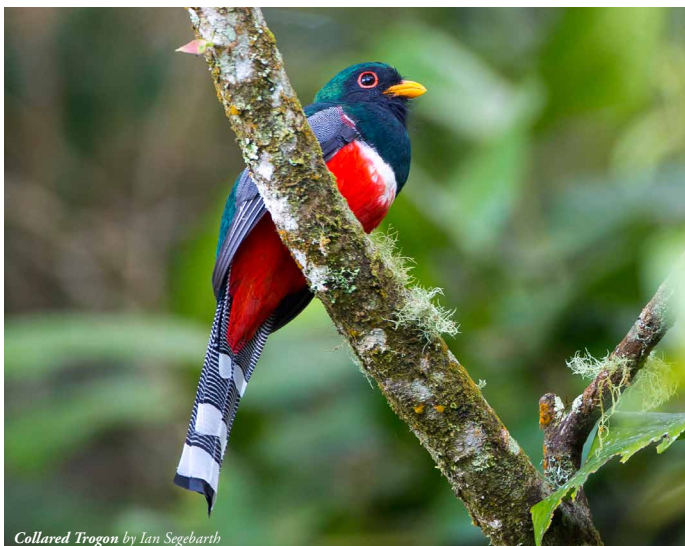
Collared Trogon by Ian Segebarth

Transfer to the airport for flights to the US. (B)