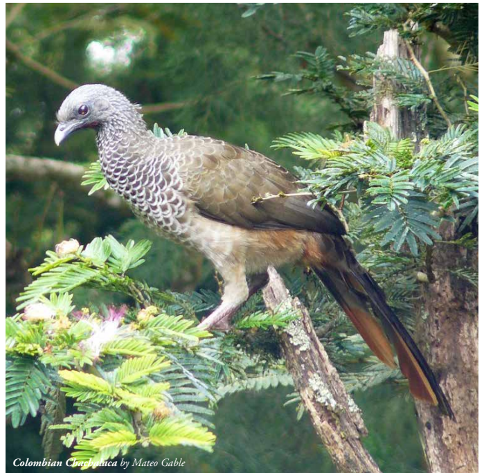
Colombian Chusquea by Mateo Gable